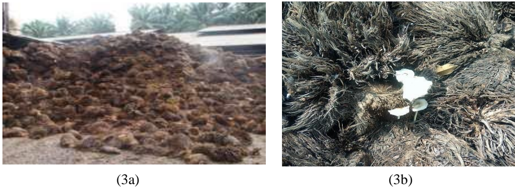
Figure 3a [18] & 3b. Composting oil palm empty bunches

which is above the surface as shown in Fig. 4 or by closing the existing waste pond using a cover with thick parachute material (covered lagoon).