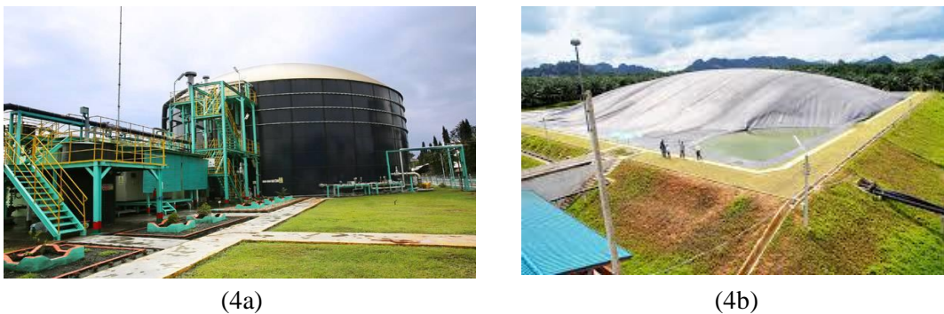
Figure 4a & 4b. Biogas Reactor & Covered Lagoon [19]