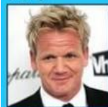
Gordon Ramsay Baker Smurf