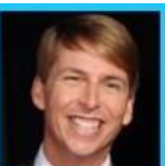
Jack McBrayer Clumsy Smurf