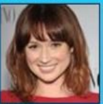
Ellie Kemper Smurfblissom