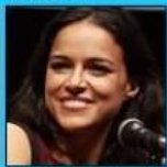
Michelle Rodriguez Smurfstorm