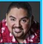
Gabriel Iglesias Jokey Smurf