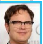
Rainn Wilson Gargamel