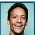
Danny Pudi Brainy Smurf