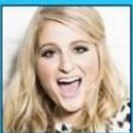
Meghan Trainor Smurf Melody