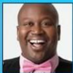
Tituss Burgess Vanity Smurf