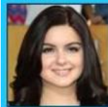
Ariel Winter Smurfette