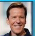
Jeff Dunham Farmer Smurf