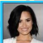
Demi Lovato Smurfette