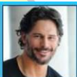
Joe Manganiello Hefty Smurf