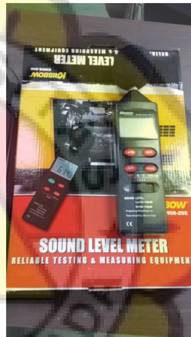
Figure 2. Sound intensity measuring instrument.