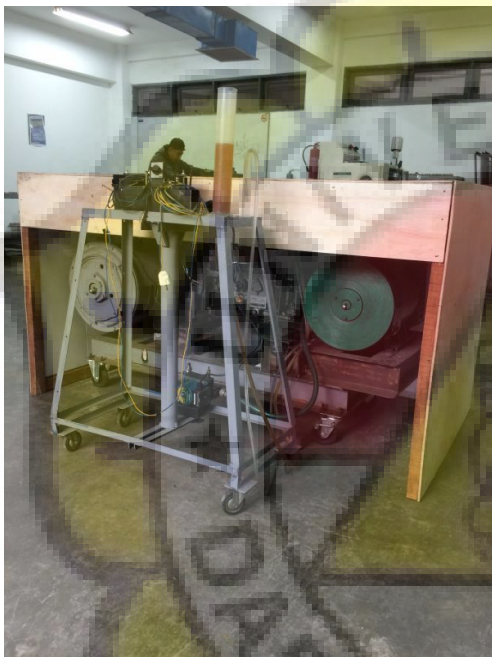
Figure 1. Part front casing sound absorbers.

At the time of sampling noise sources, there are some things that must be considered to comply with the applicable standards, first measurements were performed with a distance of between 1-2 meters from the machine. Then the height measurement is 1.2 to 1.6 m from the surface and lasts the duration of the measurement time is \pm 10 seconds for 5 minutes. Moreover, set the measurement conditions in order to facilitate the analysis as follows, condition 1: when the engine is operating without a silencer casing and condition 2: when the engine is operating with a silencer casing.