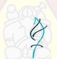
ADFEST Made in Asia