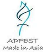
ADFEST Made in Asia ADFEST 2011 FINALIST