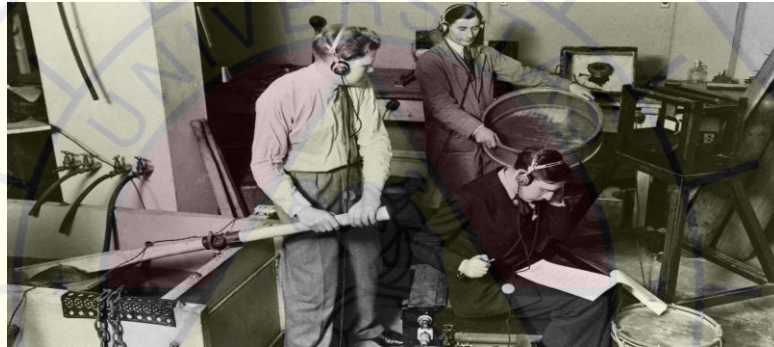
Picture 2.6 Radio Drama

Radio drama was once the prima donna of entertainment in Indonesia in the 90s. A story that is packaged in such a way that it is able to stir the emotions of the listener. They are willing to wait and leave the routine just to hear their idol characters in Radio Drama. Until now, there are still many fanatical listeners of radio dramas waiting for new radio dramas.