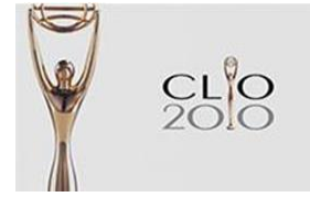
CLIO 2010 SILVER