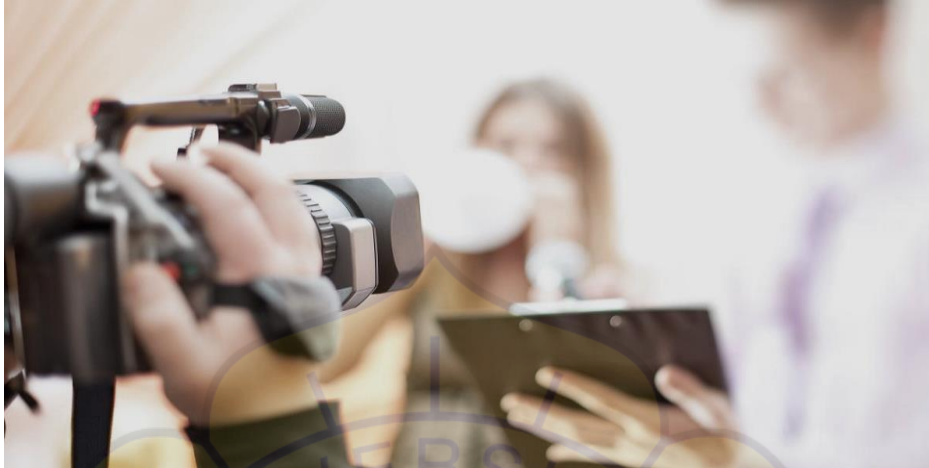
Picture 2.7 Video Presentation

Not only TV and radio advertisements, Cut2cut also helps complete presentation /corporate videos according to customer needed.