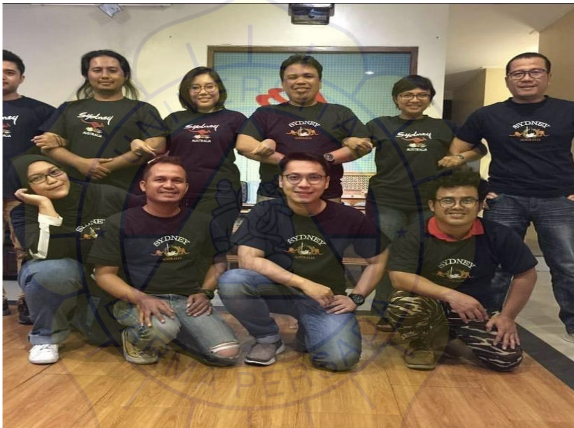
Picture 2.1 Full Team Of Cut 2 Cut Production

Cut 2 Cut Production are a team of passionate workers that always stand ready to help realize the audio creation you envision. With several decades of experience in audio production, Cut 2 Cut Production believe that Cut 2 Cut Production provide the best option. Our passion and dedication together with friendship are the values Cut 2 Cut Production adhere to when completing every job. The love for music and audio is precisely what has made us survive and grow into the expert sound facility Cut 2 Cut production are today.