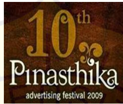
PINASTHIKA 2009 GOLD