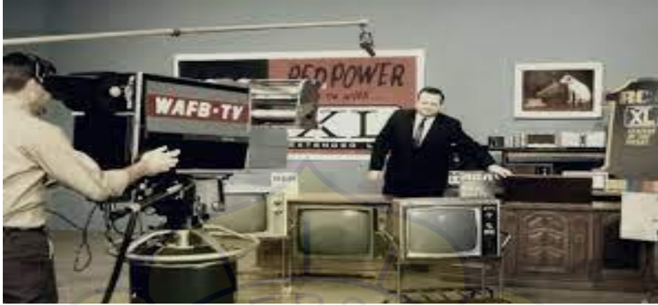
Picture 2.4 TV Commercial

Visuals will not speak for themselves without being supported by good audio. Cut 2 Cut Production really understand how to align visuals with audio to get maximum results. Because Cut 2 Cut Production have been working on that (Recording & Mixing) since 2002. Experience has taught Cut 2 Cut Production how to create audio compositions that suit your needs. Cut 2 Cut Production have produced hundreds or even thousands of TV Commercial audio