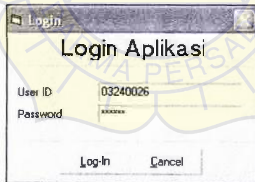
Lampiran B.2 Form Login