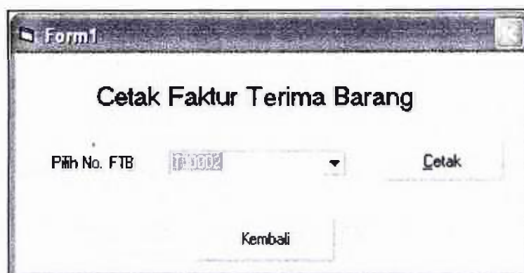
Lampiran B.9 Form Cetak FTB