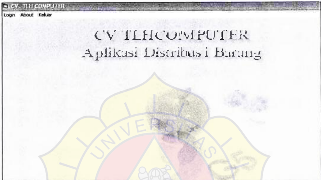
Lampiran B.1 Form Menu Utama