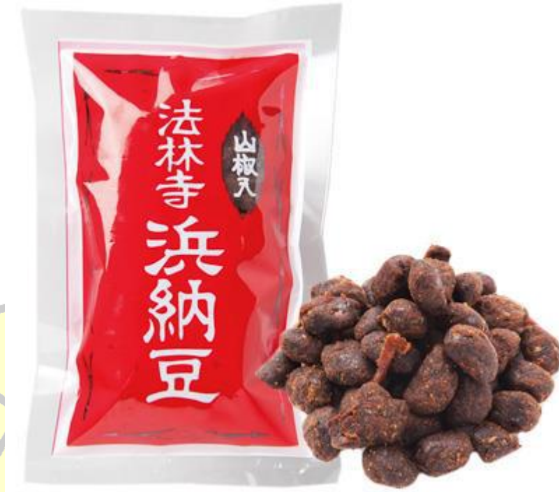
Gambar 2.5: Hama Natto