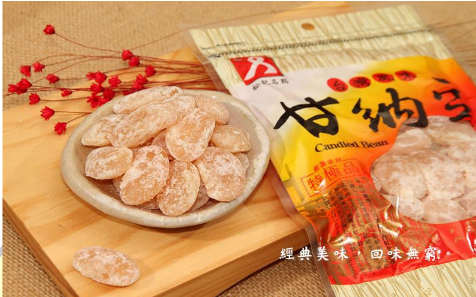
Gambar 2.8: Amanatto