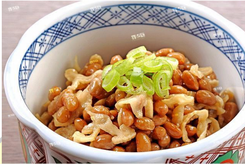
Gambar 2.1: Soboro Natto