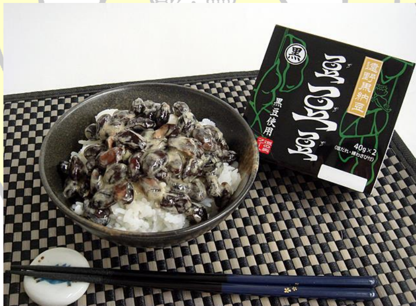
Gambar 2.4: Kuromame Natto