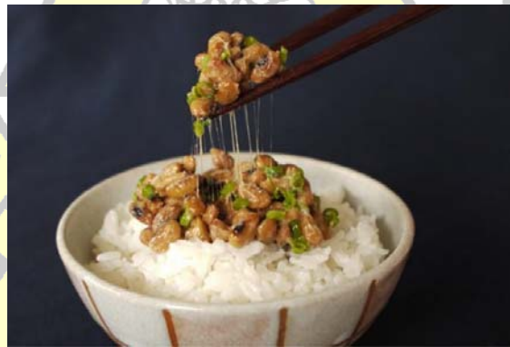
Gambar 3.4: Natto di Atas Nasi

a). pembungkus jerami, b). inside wrap , c). kyogi (serutan kayu tipis), d). inside wrap , e). wadah berbentuk perahu, f). inside boat , g). wadah PSP, h). cangkir kertas.