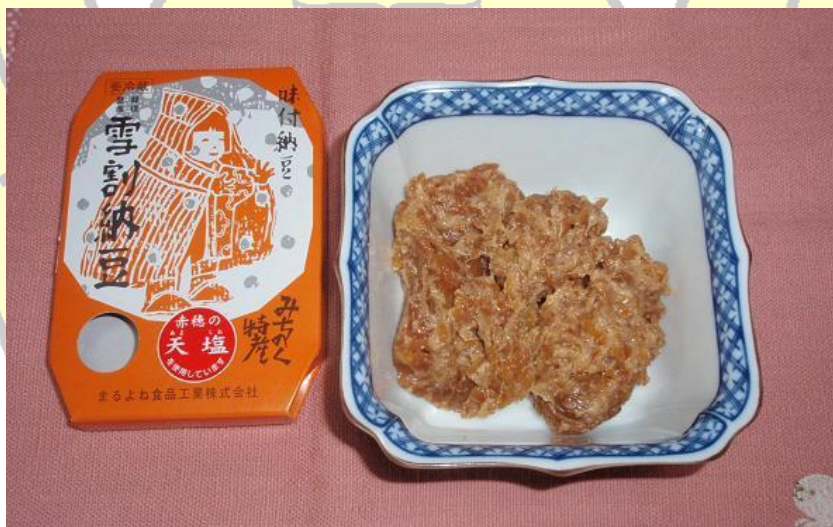
Gambar 2.7: Yukiwari Natto